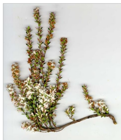
Plate 1. Epacris virgata