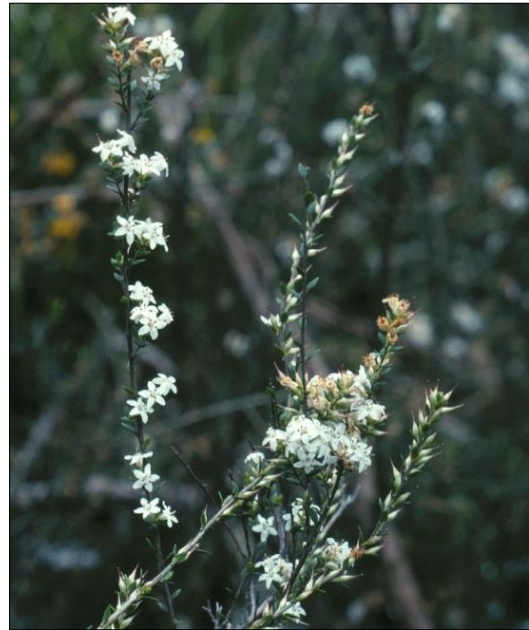
Plate 2. Epacris virgata

Flowers are white, solitary in the leaf axils, subsessile and scattered sparsely along new branches. Style 4 to 4.5 mm long; stigma and anthers prominently exserted from the corolla tube which is 2.5 to 3 mm long and has five lobes 3.5 to 4.2 mm long. The species is distinguished by its long virgate ultimate branches, non-pungent leaves and prominently exserted floral parts (Keith 1998).