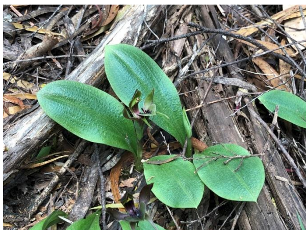
Plate 2. Chiloglottis valida growing in situ on Mount Dial

[description based on Jones (1991), Jones (2006), Jones et al. (1999), M. Wapstra pers. obs.]