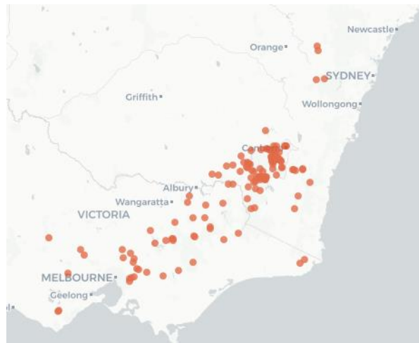
Figure 2. Distribution of Chiloglottis valida on mainland Australia