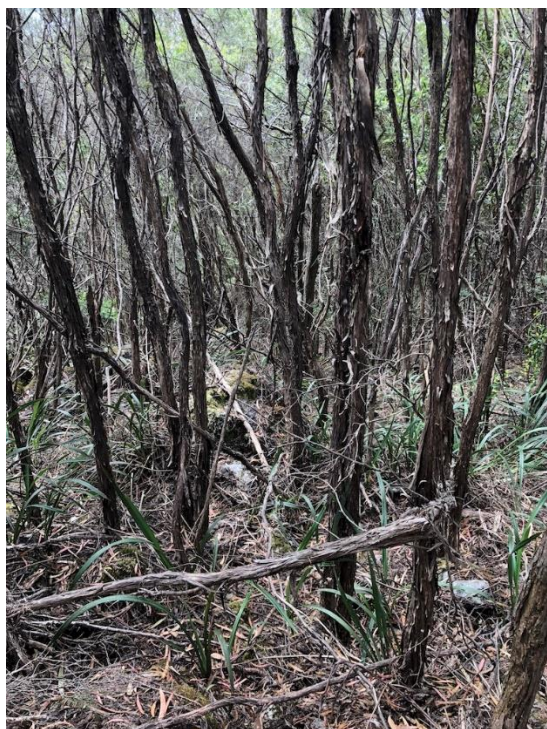
Plate 3. Habitat of Chiloglottis valida on Mount Dial