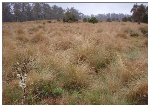
Plate 3. Native Poa grassland habitat in the northwest plains.

The species' distribution is severely fragmented, as extensive areas of its habitat have been cleared for agriculture and forestry plantations. The remaining grassland fragments are often isolated and separated by unsuitable habitat (e.g. exotic pasture, dense forest, and forestry plantations).