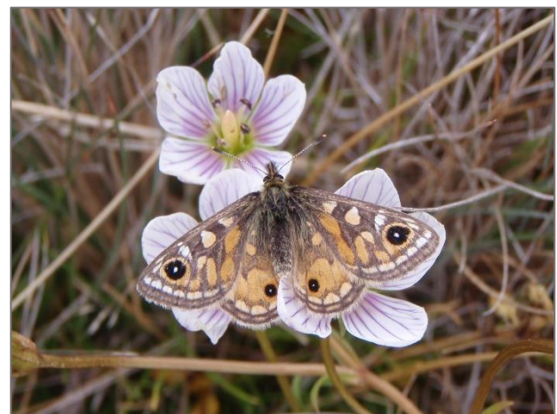
Plate 3. Female ptunarra brown butterfly.

[Description from Bell 1998, TSS 1999, Braby 2000, Anderson 2010]