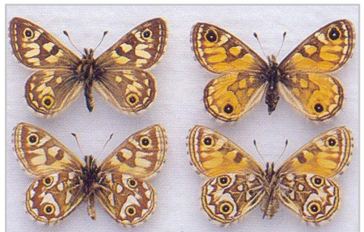
Plate 1. Ptunarra brown butterfly: male (LHS) and female (RHS); showing upper side (top) and underside (bottom).