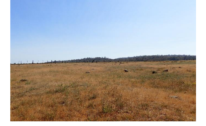
Plate 3. Overview of the native grassland on basalt in which Senecio longipilus occurs