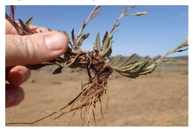
Plate 2. Root system of, showing the obscure taproot and fleshy secondary roots and ascending branches

The peak flowering period of most species of Senecio is spring through summer and into autumn, but the detection window is likely to be much wider, although confirmation of identification usually requires mature achenes (Wapstra et al. 2008). Thompson (2004) suggested Senecio longipilus flowers in summer. While fertile material is present on the collection from Kingston in October 1929, observations in early January 2020 from St Patricks Plains suggest flowering may peak in late January (M. Wapstra & G. Daniels pers. obs.).