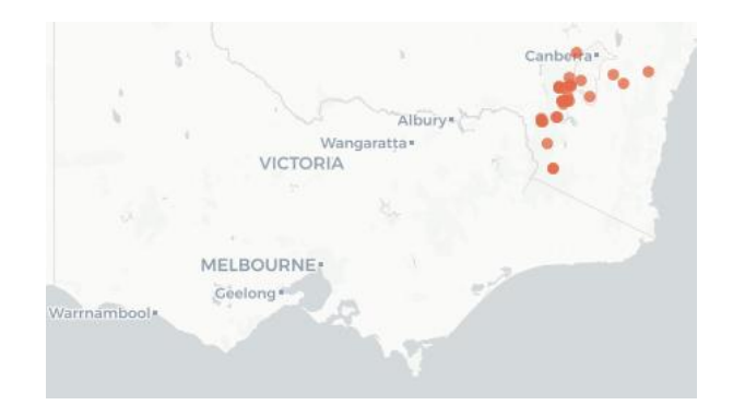
Figure 2. Mainland Australian distribution of Senecio longipilus

Senecio longipilus is part of a small suite of superficially similar and uncommon species (e.g. Senecio macrocarpus, Senecio squarrosus) so confirmation of suspected specimens by specialists familiar with the species-group should be sought. Wapstra et al. (2008) provides a key to Tasmanian species of Senecio, but the key and descriptions in Thompson (2004) should be used to confirm the identification. As with most Senecio material, roots, lower stems, as well as lower, middle and upper stem leaves are usually required to correctly identify a species.