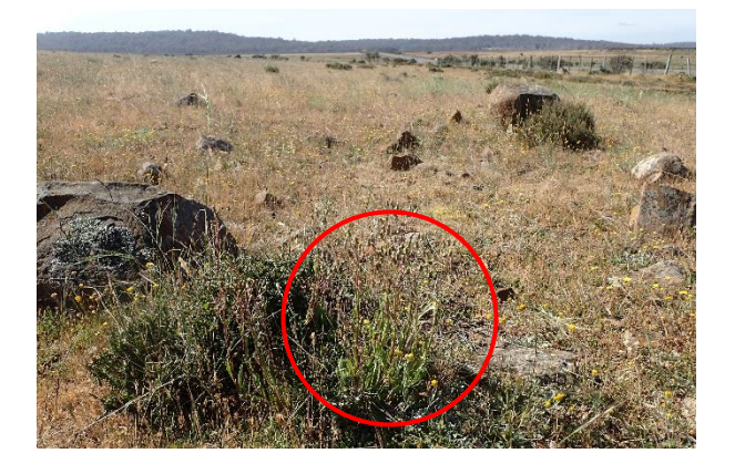
Plate 4. Senecio longipilus (circled) associated with localised basalt outcrops