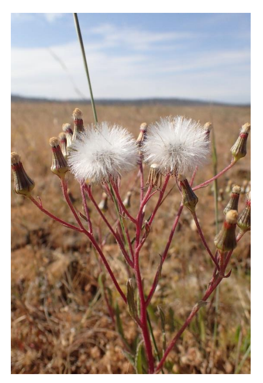
Plate 1. Senecio longipilus