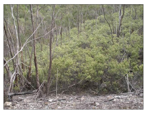
Plate 2. Pomaderris pilifera subsp. talpicutica at Boyer