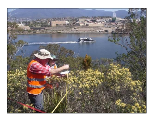
Plate 3. Monitoring Pomaderris pilifera subsp. talpicutica at East Risdon State Reserve in September 2015