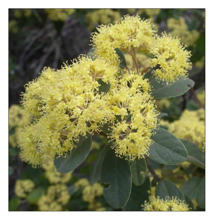
Plate 1. Pomaderris pilifera subsp. talpicutica