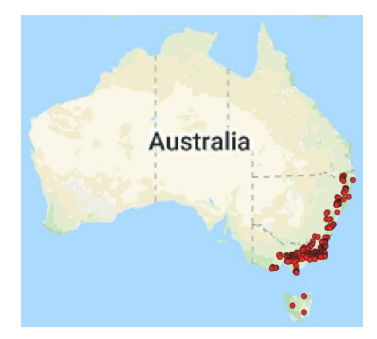
Figure 2. Distribution of Veronica notabilis (Atlas of Living Australia, downloaded 10/10/2018)

On mainland Australia, Veronica notabilis occurs in Victoria, New South Wales and the Australian Capital Territory (Figure 2).