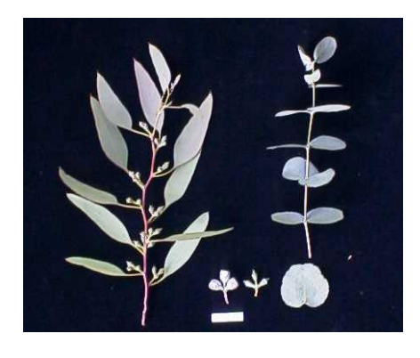
Plate 1 . Eucalyptus morrisbyi : buds, capsules, adult & juvenile leaves (scale bar=2cm)