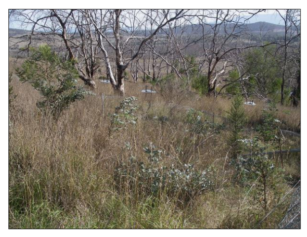
Plate 2. Calverts Hill site, April 2016

Eucalyptus morrishyi has undergone a dramatic decline in recent decades to the point at which the species is at imminent risk of becoming extinct in the wild. Extinction of the species as a whole is unlikely, at least in the short to medium term, given the presence of ex situ and ornamental plantings. The main issues with the decline and recovery prospects are discussed below.