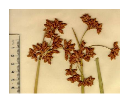
Schoenoplectus tabernaemontani seedheads. Tasmanian Herbarium specimen.

There is not enough information available to enable a meaningful reassessment of Schoenoplectus tabernaemontani . This species may have been introduced to Tasmania. It was first collected in 1894 from Launceston and it is likely that it would have been found earlier if native. The next collection was not until 1966 on King Island (A. Buchanan, pers. comm.). If deemed to be introduced a nomination to delist the species will be prepared.