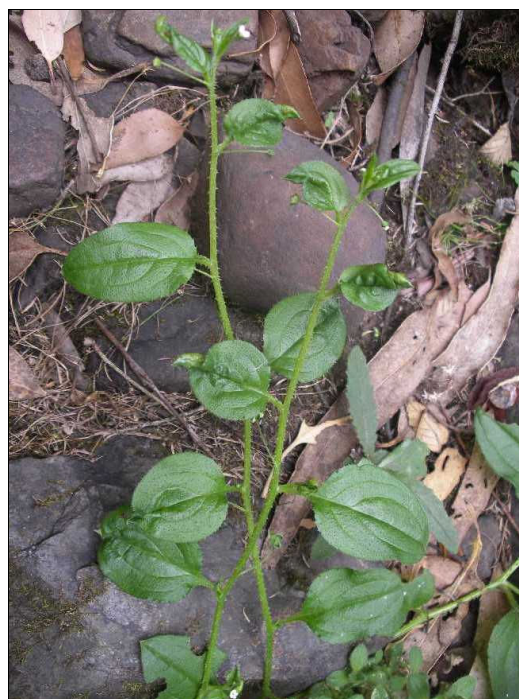
Plate 1. Austrocynoglossum latifolium habit