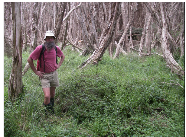
Plate 2. Austrocynoglossum latifolium growing within paperbark swamp forest along the Seal River

Austrocynoglossum latifolium occurs in New South Wales, Queensland, South Australia, Victoria and Tasmania (Jeanes 1999). Within Tasmania the species is known to be extant at four widely-separated locations (Figure 1): Seal River on King Island, Parramatta Creek near Railton, the Rosedale Road area northwest of Bicheno, and along the Great Musselroe River near Pioneer. There are historic records from the Circular Head and Mole Creek areas (Table 1). The linear range of the species' known extant sites in Tasmania is 410 km and the extent of occurrence about 19,000 km 2 (which includes large areas of sea). The area of occupancy is in the order of 20 to 25 ha.