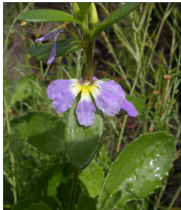
Plate 1. Scaevola aemula : flowering branch (image by Richard Schahinger)