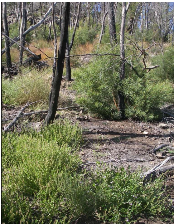
Plate 3. Campbells Sugarloaf site, April 2014: Scaevola aemula and Gyrostemon thesioides in foreground and background, respectively

evidenced by the discovery of the species at Mount Peter in 2008 and the Daggs Hill – Campbells Sugarloaf area in 2014. Gyrostemon thesioides (broom wheelfruit) may be used as a highly visible surrogate target (Plate 3), as it has been recorded at most contemporary sites. Potential areas for survey might thus include Buxton River Conservation Area (North et al. 1998), Dry Creek East Nature Reserve (Craven et al. 1999), and along the O Road a few kilometres north of Cherry Tree Hill (within Apslawn Regional Reserve), the focus being on areas that have been recently burnt.