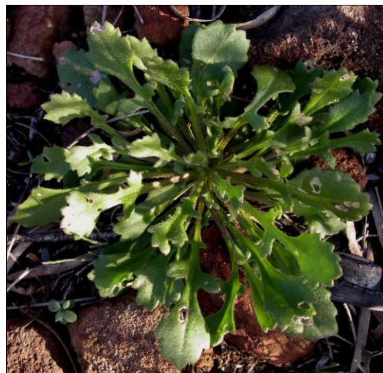
Plate 2. Lower leaves of Scaevola aemula

Scaevola aemula can be distinguished from the other Scaevola species in Tasmania by the presence of a conspicuous tuft of bristles on the back of the indusium (frontispiece, Rozefelds 2001).