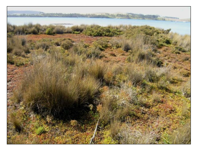
Plate 3. Habitat at Double Creek

Limonium australe var. baudinii is endemic to Tasmania (de Salas & Baker 2017). It is known to be extant in the Triabunna area in the central east and near the mouth of the Saltwater River on the Tasman Peninsula. There is also an historic record from the latter region at Port Arthur, though the site's precise location and current status are unknown.