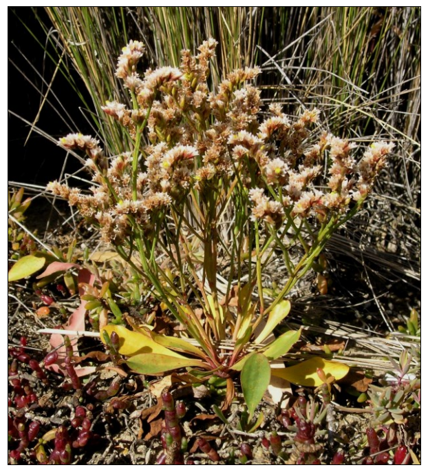
Plate 1. Limonium australe var. baudinii in flower