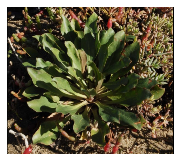
Plate 2. Leaves of Limonium australe.

An additional saltmarsh species, the malvaceous Lawrencia spicata , also has a basal rosette of leaves. However, its leaves have crenate margins and very distinct petioles, and the species has, as its name suggests, erect flowering spikes rather than a multi-branched panicle.