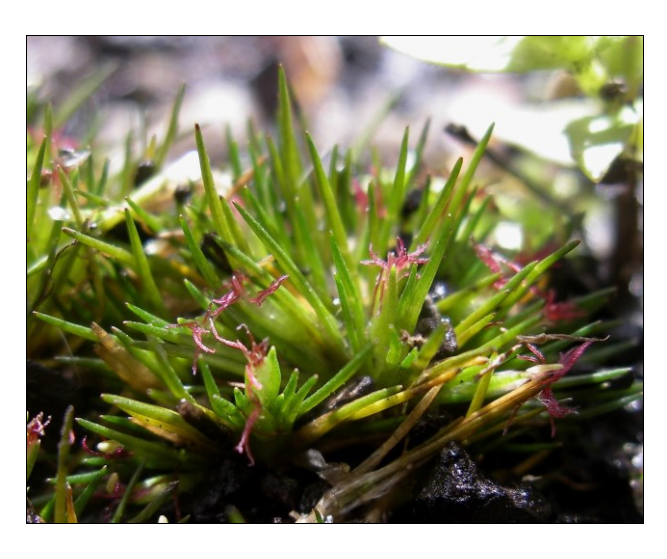
Plate 1. Centrolepis pedderensis in flower