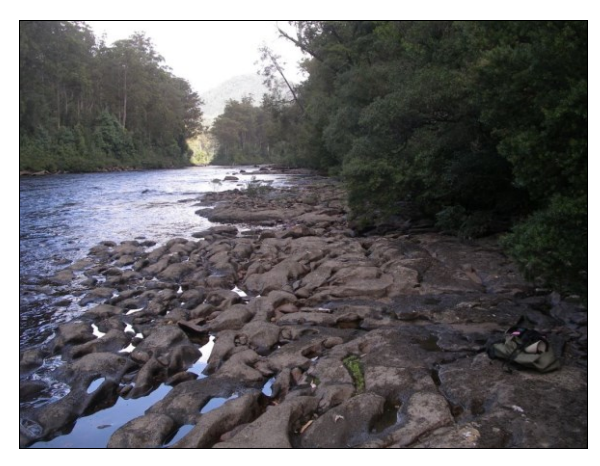
Plate 5. Habitat along the Huon River near Tahune, February 2014