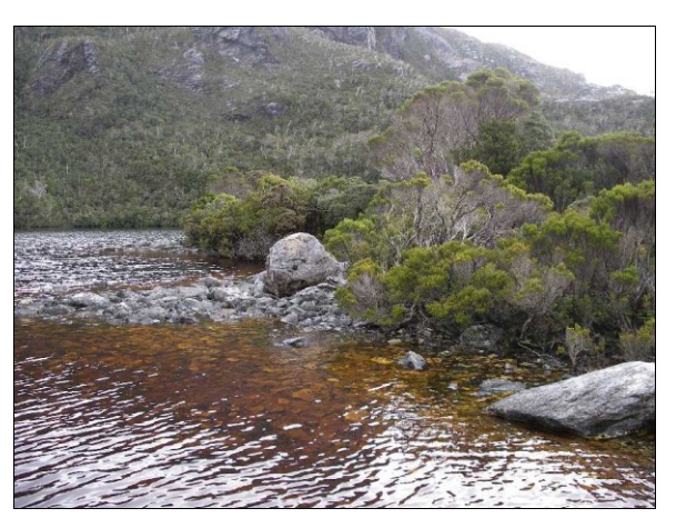
Plate 4. Habitat at Sanctuary Lake, March 2005

will be uncovered along the Huon and Picton rivers given a targeted and well-resourced survey effort, while a number of glacial tarns in the Frankland and Wilmot Ranges support potential habitat.