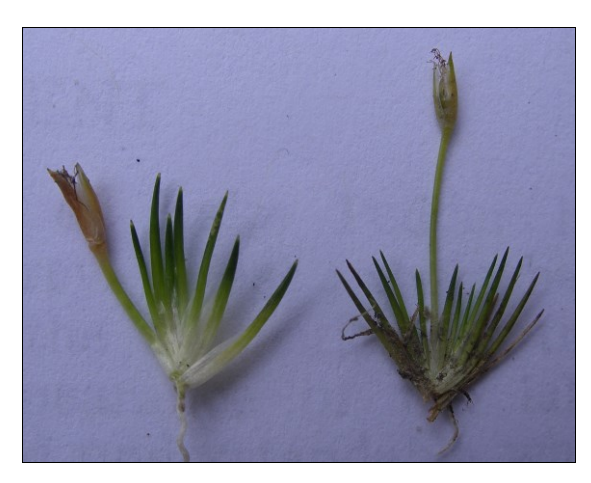
Plate 3. Centrolepis muscoides & C. pedderensis at the fruiting stage