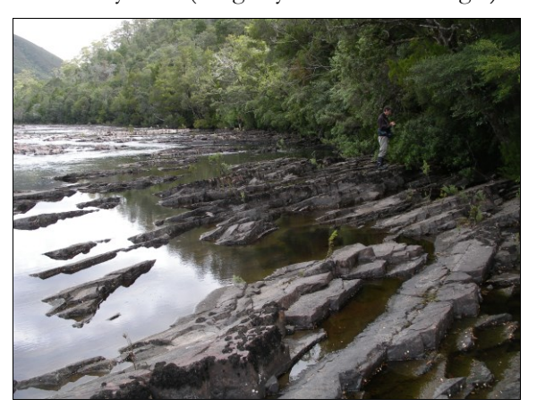
Plate 6. Habitat along the upper reaches of the Huon River, February 2018