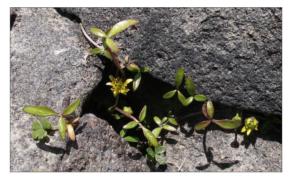
Plate 1. Ranunculus collicola: habit