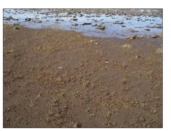
Plates 4 & 5. Ranunculus collicola: habitat at Second Lagoon (January 2018)