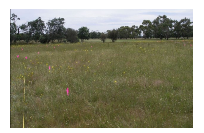
Plate 2. Prasophyllum olidum: native grassland habitat

^ = covered by a conservation covenant under the Tasmanian Nature Conservation Act 2002; * NRM Region = Natural Resource Management region.