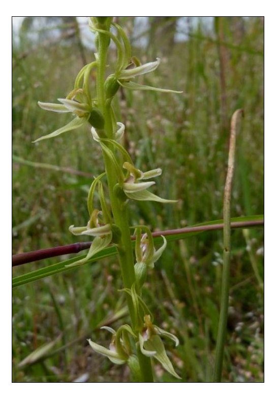
Plate 1. Prasophyllum olidum: flower detail