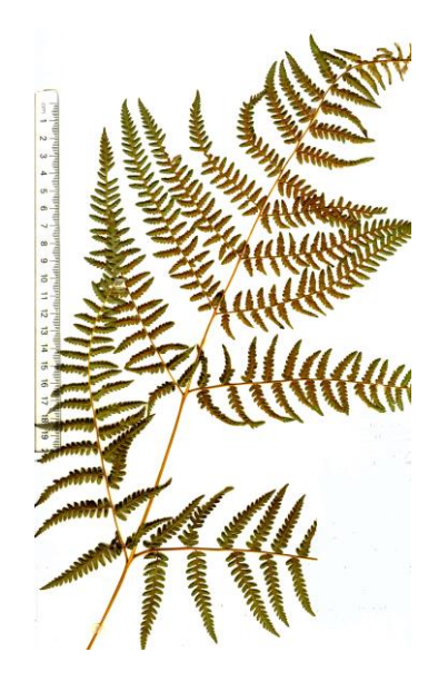
Hypolepis muelleri. Tasmanian Herbarium specimen.