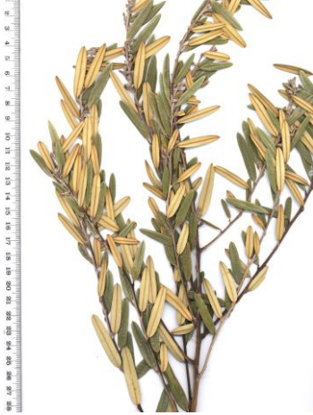
Hovea tasmanica . Tasmanian Herbarium specimen.