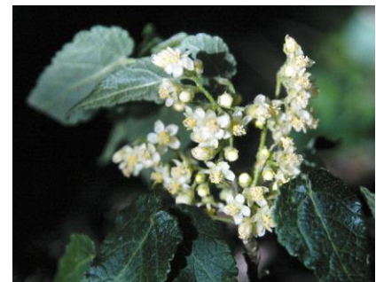
Gynatrix pulchella . J. Roberts.

Recruitment occurs after gap-forming disturbance. Flood events have proven to aid seed dispersal through disturbance and a subsequent increase in openness (TPLUC 1996). Cattle graze at one particular site however there is no evidence of browsing pressure on the population.