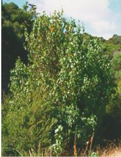
Gynatrix pulchella . A. Povey.