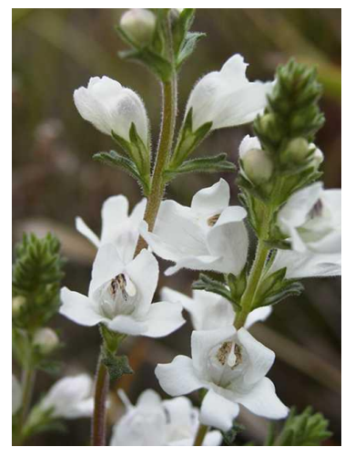
Euphrasia collina subsp. deflexifolia. N. Lawrence.