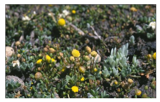
Cotula vulgaris var. australasica H & A Wapstra