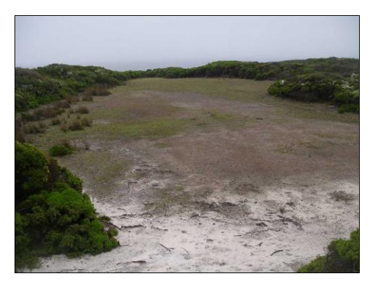
Cotula vulgaris var. australasica habitat: saline herbfield in Seal Rocks State Reserve, King Island.

Curtis, WM 1963, The Student's Flora of Tasmania, Part 2, Government Printer, Tasmania.