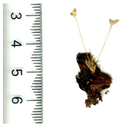
Centrolepis strigosa subsp. pulvinata . Tasmanian Herbarium specimen.