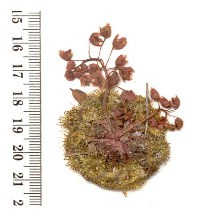
Drosera glanduligera. Tasmanian Herbarium specimen.