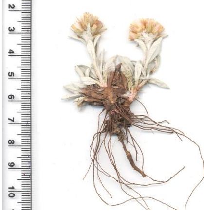
Argyrotegium fordianum . Tasmanian Herbarium specimen.