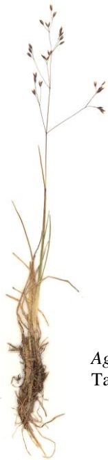
Agrostis diemenica . Tasmanian Herbarium Specimen.