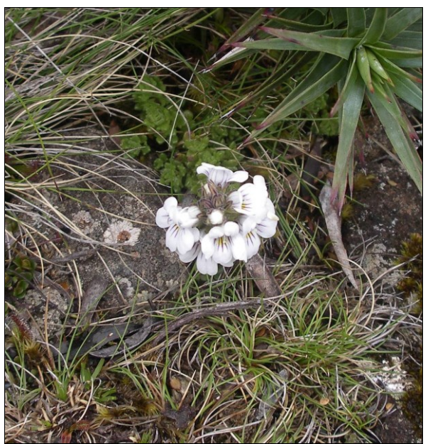
Plate 1. Euphrasia gibbsiae subsp. wellingtonensis: foliage and habit