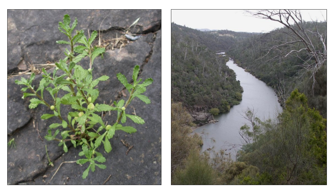
Plate 1. Centipeda cunninghamii: habit and habitat along the South Esk River

Counsel Hill Conservation Area, Trevallyn Nature Recreation Area, Public Reserve (Hadspen).