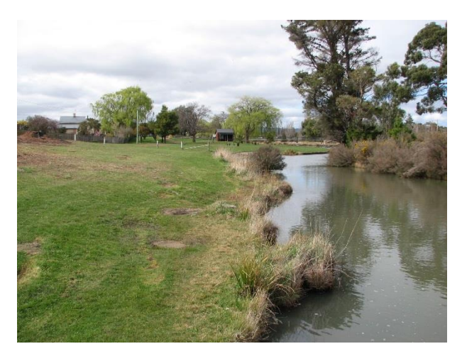
Plate 2. Habitat of Senecio campylocarpus along the banks of the Elizabeth River in Campbell Town with the species occurring amongst sedges and grasses on the river bank

amongst river rocks forming small shallow rapids (Plates 2 & 3). The fringes of the river are all grassy and weedy with willows, blackberries, slashed old pasture and mown lawns of a public park. The habitat of the site near the North Esk River was described as an overgrown paddock on a broad grassy floodplain of a major river subject to periodic inundation. The Meander River site on Westwood Road west of Launceston is a grassy, weedy open river bank. Thompson (2004a) described Senecio campylocarpus on mainland Australia as occurring on loam to clay soils in forest and woodland, usually in seasonally inundated areas.