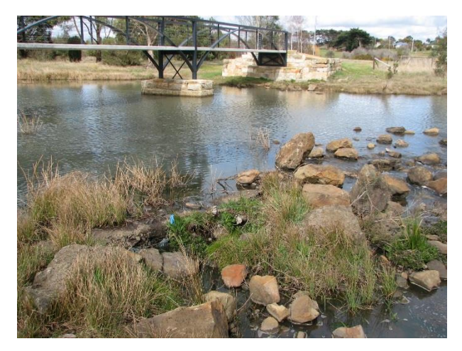
Plate 3. Habitat of Senecio campylocarpus along the banks of the Elizabeth River in Campbell Town with the species occurring amongst river rocks forming a small series of rapids in drier times (image by Mark Wapstra)

Plate 2. Habitat of Senecio campylocarpus along the banks of the Elizabeth River in Campbell Town with the species occurring amongst sedges and grasses on the river bank (image by Mark Wapstra)