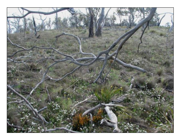
Plate 4. Grassy woodland habitat at Oakden Hill