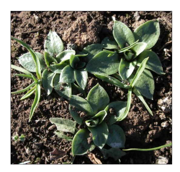
Plate 2. Leaf rosettes of Pterostylis wapstrarum

Pterostylis wapstrarum is endemic to Tasmania, occurring in the southern Midlands, although historical records suggest a wider range, including the Derwent Valley, Central Plateau and southeast near-coastal region (Figure 1).