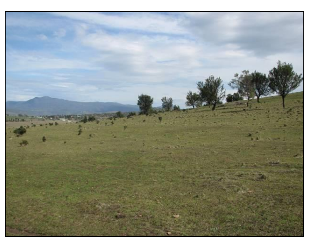
Plate 3. Native grassland habitat at Pontville