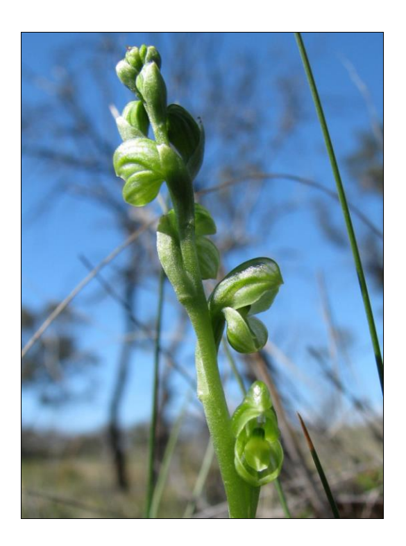
Plate 1. Flower spike of Pterostylis wapstrarum