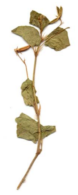
Viola caleyana. Tasmanian Herbarium specimen.