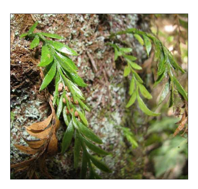
Plate 1. Tmesipteris parva detail