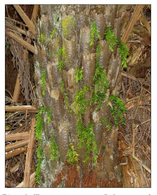
Plate 2. Tmesipteris parva on Cythaea australis

There were at least 1600 plants on 48 host plants in the subpopulation along Bob Smiths Gully on Flinders Island in 2008, with just 10 plants recorded from the Naracoopa subpopulation in 2009 (Table 1). The status of the Grassy River subpopulation is uncertain — surveys in 2007 and 2009 failed to locate plants and it is considered likely that it may be extinct as a consequence of long-term drought.