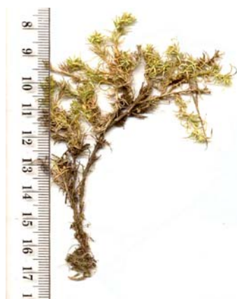
Scleranthus brockiei . Tasmanian Herbarium specimen.