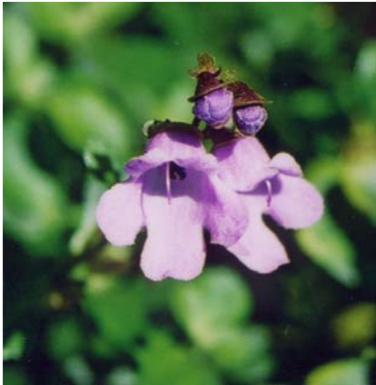
Prostanthera rotundifolia.