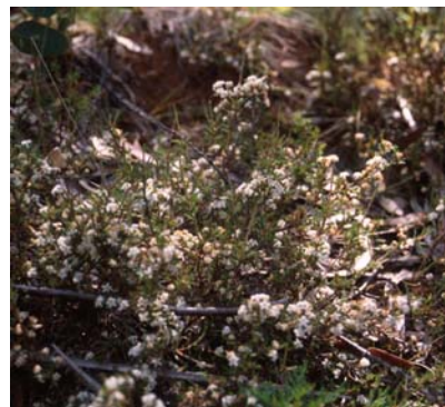
Pentachondra ericifolia . N. Lawrence

Castle Cary Regional Reserve, Mount Dromedary Forest Reserve, Mount Victoria Forest Reserve, St Pauls Regional Reserve, Table Mountain Conservation Area.