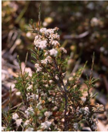
Pentachondra ericifolia.