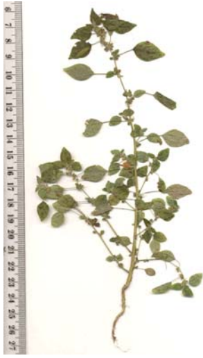
Parietaria debilis . Tasmanian Herbarium specimen.