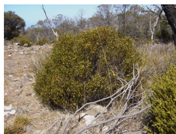
Ozothamnus lycopodioides . E. Lazarus

A slender, much branched, spreading shrub between 50-100 cm tall. Leaves: The leaves are overlapping and stalkless with the base attached to the stem (between 5-7 mm long). This causes the stem to be scarred with blunt projections after the blade has fallen away. The blades are erect or half spreading and narrow with a blunt tip. The leaves are also leathery (with the same structure on both sides) and apparently hairless, but they are often sticky with oily hairs. Flowers: The flower heads are stalkless and arranged in dense clusters at the ends of the branches. There are between 10-12 flowers together that are surrounded by the upper most foliage leaves. The oval-shaped heads are between 3.5-50 mm long. The outer bracts (leaf-like structures associated with flower) are thin, dry, sticky, brown and sparsely hairy – they are also somewhat hardened. The inner bracts have rounded tips that are dark brownish-purple and erect or curved inwards. There are between 18-24 florets that are longer than the flower bracts. Flowering in spring. Fruit: The fruit is small and dry with leathery walls and a covering of minute projections. The pappus (ring of scales or hairs found on top of fruit) has bristles with tiny barbs, the tips are thickened and also covered with minute projections (description from Curtis 1963). Herbarium specimens have been collected through most of the year. This species was previously known as Helichrysum lycopodioides .