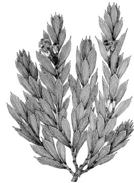
Leucopogon esquamatus . R. Hale.

Key sites include Palana Road, Summer Camp, Whitemark, the Darling Range, west of Mt. Boyes, south of Leeka, Mount Killicrankie (near tin workings east of Mt Tanner) and west of Mt. Munro and Ned's Point on Cape Barren Island.