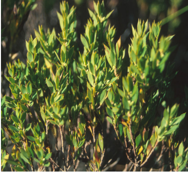
Leucopogon esquamatus . S.Harris.