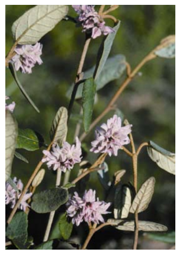
Lasiopetalum discolor.