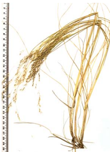
Lachnagrostis. robusta. Tasmanian Herbarium specimen.