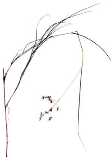
Hierochloe rariflora . Scans: N. Fitzgerald