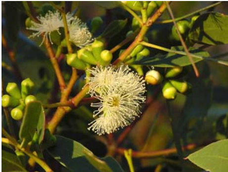
Eucalyptus barberi flowers.