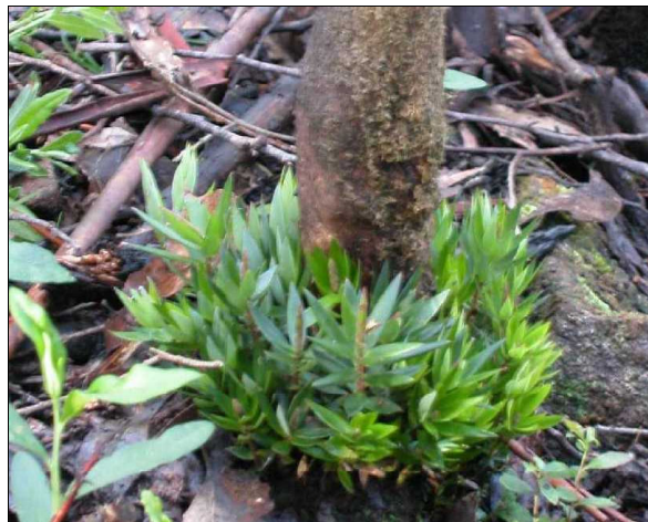
Plate 2. Coppice regrowth.

Cyathodes platystoma is not reliant on disturbance for its persistence. Pennington (2004) found Cyathodes platystoma to be a continuously recruiting species. It is likely this continuous recruitment is facilitated by bird-dispersal of seed.