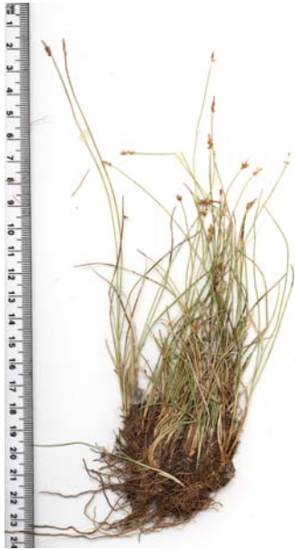
Carex capillacea . Tasmanian Herbarium specimen.