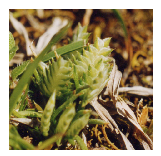
Aphelia pumilio.