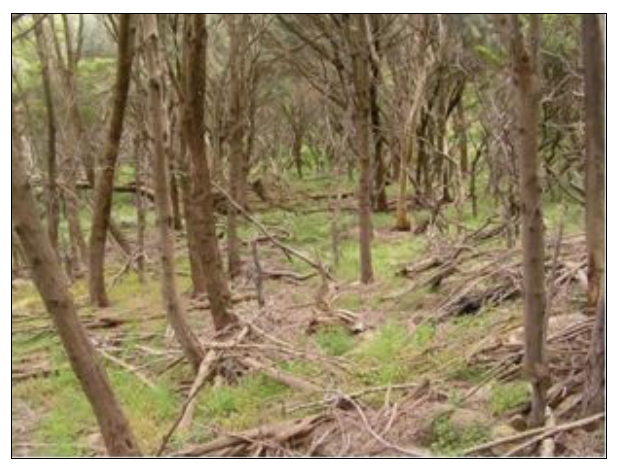
Plate 2. Habitat of Caladenia prolata on Deal Island

On Flinders Island Caladenia prolata is restricted to the surface of granite boulders and seems to be absent from nearby ground (but this may be due to extensive ground disturbance by feral pigs). On Deal Island the species has been recorded from the slopes of two gully systems dominated by Allocasuarina verticillata (with sparse Eucalyptus nitida ) and a Poa labillardierei and light bracken understorey (Plate 2).