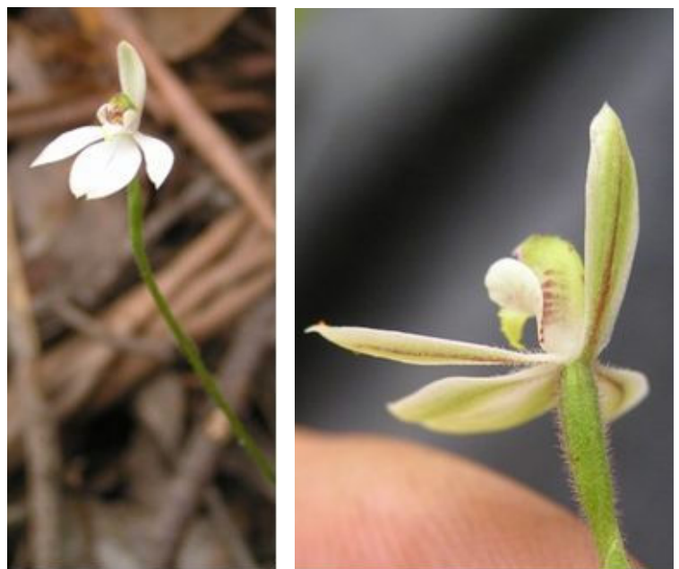
Plate 1. Caladenia prolata from Deal Island