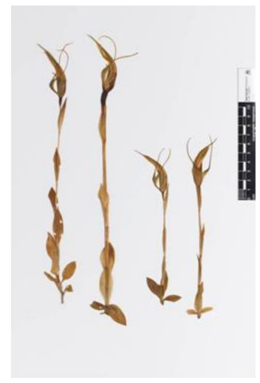
Plate 1. Pterostylis falcata (ex NSW)